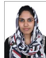
Hafila V T Rank 5